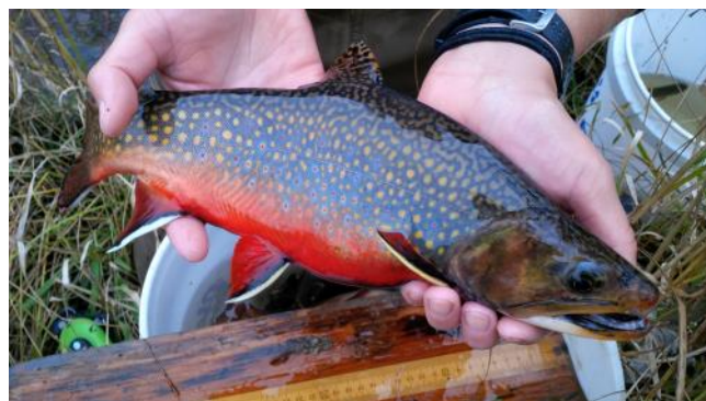
Male brook trout captured in Upper Middle Inlet, a small stream in northeastern Wisconsin.

The Wild Trout Symposium, held every 3-5 years in West Yellowstone, Montana, offers a unique forum to exchange viewpoints on wild trout research, management, and public policy. Don't miss out on this exciting opportunity to join other biologists and anglers to hear about world-class wild trout research and management innovations in an area known for its world-class trout fishing. For more information please visit the symposium website . Hurry, early registration ends September 1!