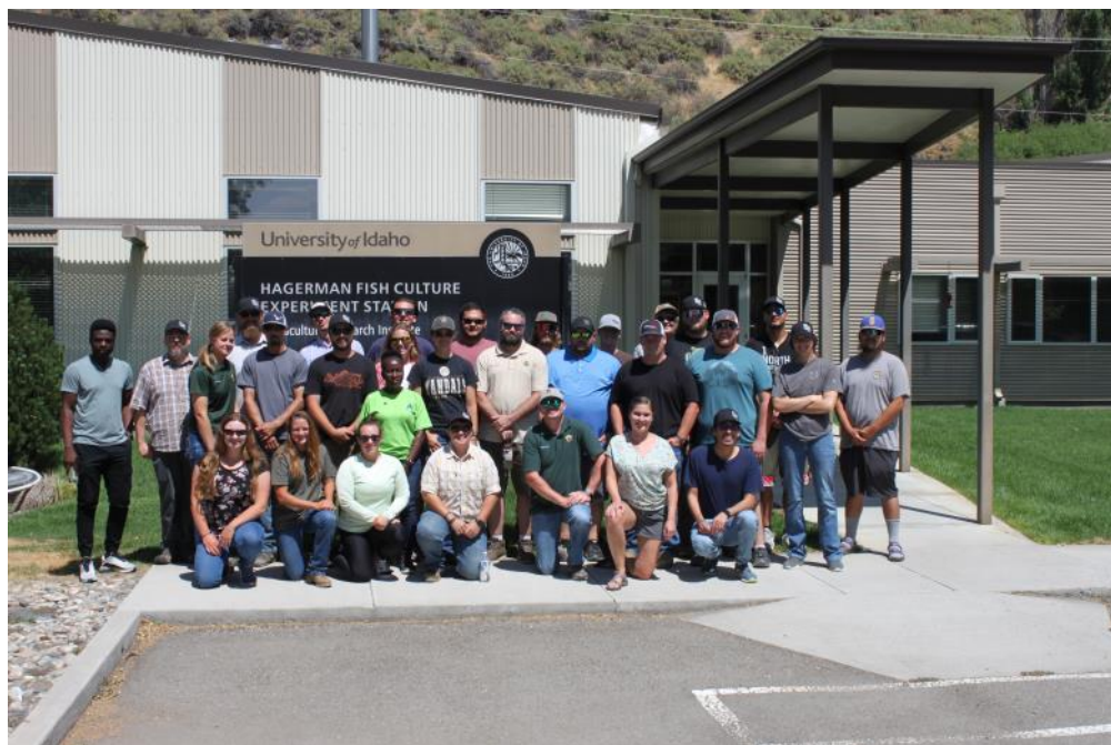
Attendees at the Coldwater Fish Culture Course at the Hagerman Fish Culture Experiment Station in early August 2022.