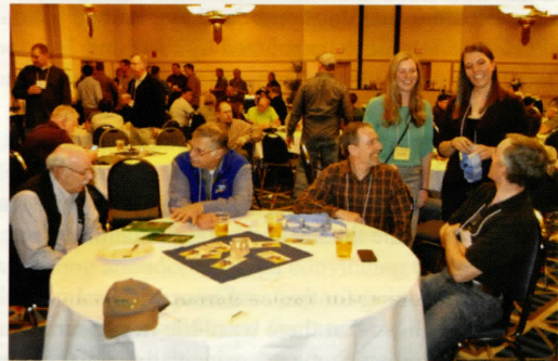
Great interactions were had at our poster sessions and banquet.