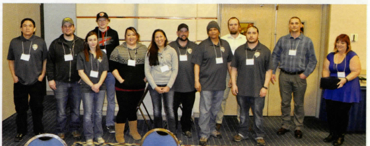
Our Excellence in Aquaculture Award was presented to the Kootenai Tribe of Idaho.